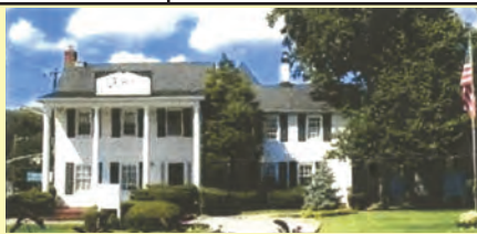
Family Owned and Operated